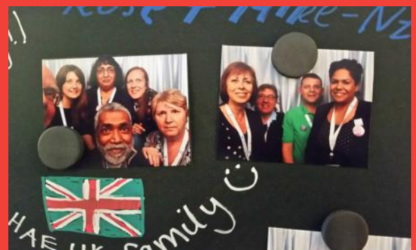
In 2014 10 patients and family members attended the HAE Global Conference in Washington DC, as well as Consultants and Specialist Nurses from the UK (above).

We hope you will join us for a life changing weekend.