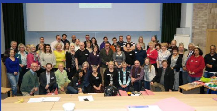
Some of the attendees at last years' patient day in Cambridge

If you are planning on attending the patient day and would like to book accommodation for the night, the closest hotel is the Premier Inn which is a 6 minute walk (Premier Inn Birmingham City Centre New Street Station Hotel.)